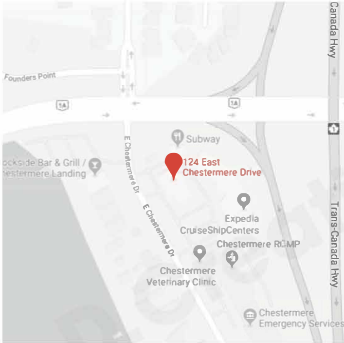
124 E Chestermere Dr.