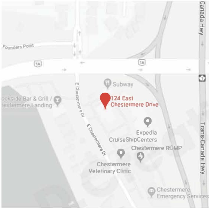
124 E Chestermere Dr.